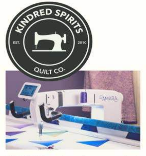
Kindred Spirits is proud to carry these renowned brands: