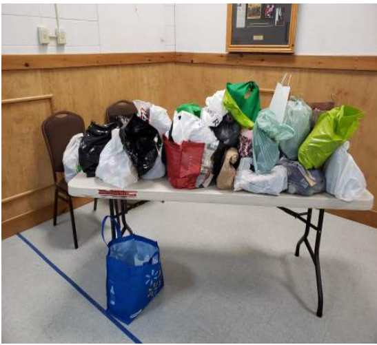
Picture of Raft donations in November