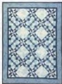
Fresh Cut Roses